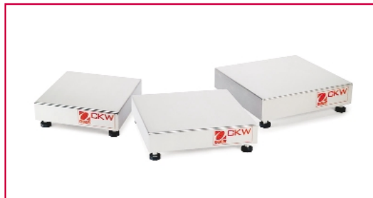
4 x capacity models in 3 base sizes