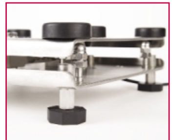
No visible threads assures conformance to Food Safety standards and minimised contamination area